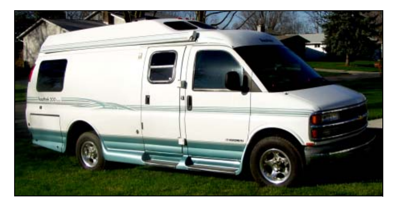
Figure 3, The Big Turtle

There is a lot to be said about the convenience of camping in relative luxury in the Big Turtle . Compared to any of our previous camping experiences, it is like bringing the comforts of home along with you. The question for most folks is whether it is worth the price to sleep just about anywhere you like in your own bed every night rather than sharing bedding and such with mystery motel travelers. For our part, we are enjoying the independence. We will see how we feel after living for a while with the adventure of being responsible for maintaining a private house on wheels.